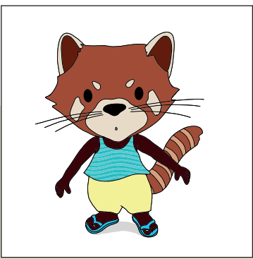
Favourite Ice-cream flavour: Watermelon