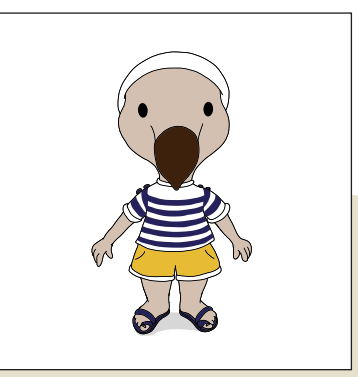
Favourite Ice-cream flavour: Apricot